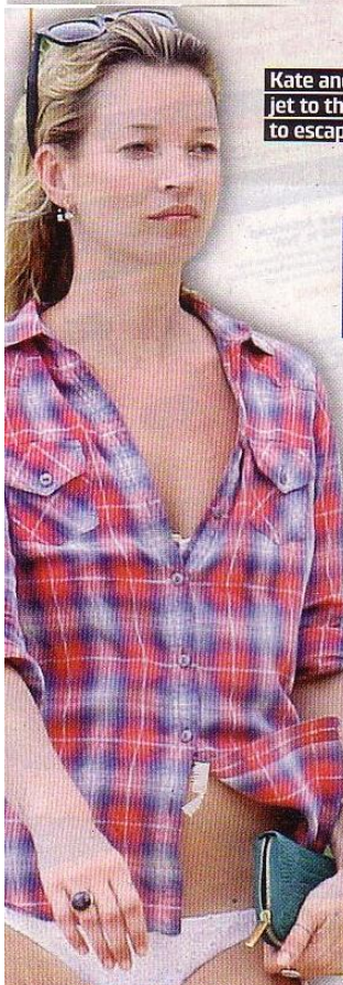
Kate and Scarlett often jet to the stunning island to escape the paparazzi

W hen it comes to the sort of break where all you want to do is switch off and chill by warm tropical waves with a cocktail in your hand, nowhere beats Jamaica.