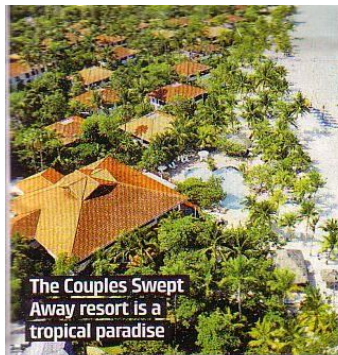
The Couples Swept Away resort is a tropical paradise