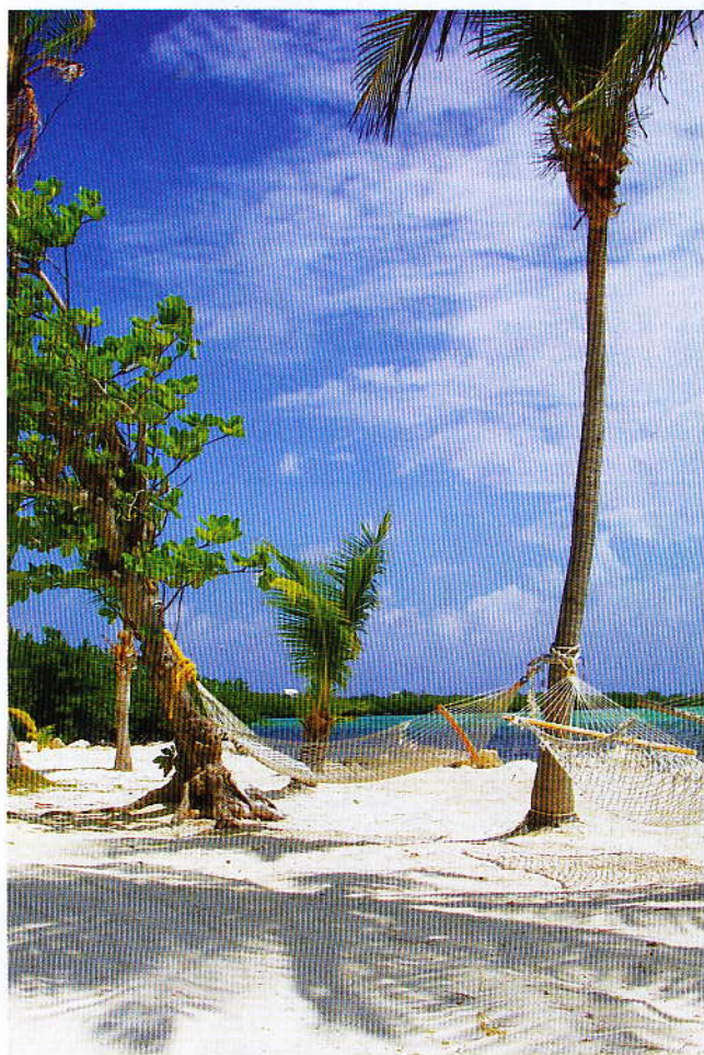
Best Destination • Friendliest Destination • Best Snorkling

CT+L readers don't just like the Caribbean, they love it. And your 150,000 votes in our annual Best of the Caribbean Readers' Poll, endorsing the destinations, resorts, cruise lines and activities that have helped make your island fantasies reality, told us exactly how much. Check out your fellow readers' top picks over the past year – and take inspiration for your own Caribbean dreams in the months to come.