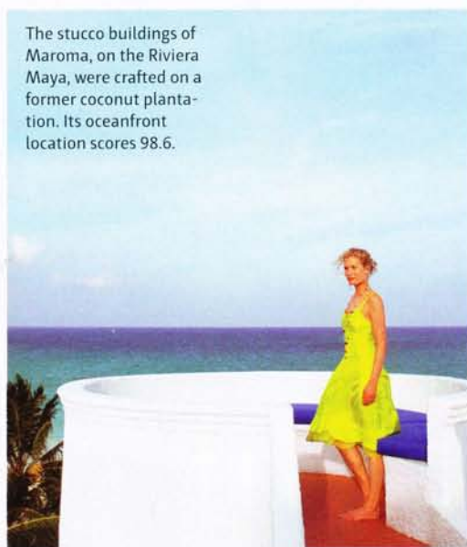
The stucco buildings of Maroma, on the Riviera Maya, were crafted on a former coconut plantation. Its oceanfront location scores 98.6.

M EXICO HAS ITS CHALLENGES these days, but they have not deterred the visionary development of its shorelines—the Riviera Maya on the Atlantic, the Riviera Nayarit on the Pacific—which are undergoing huge building booms. The appeal is clear: beachfront locations, easy access from the United States (most of these resorts are within an hour's drive of the international airports of Cancún or Puerto Vallarta), and hotel brands that cater to the luxe market. Such growth has had a marked effect on our Gold List: Six resorts on the Yucatán Peninsula and the Riviera Nayarit debut this year.