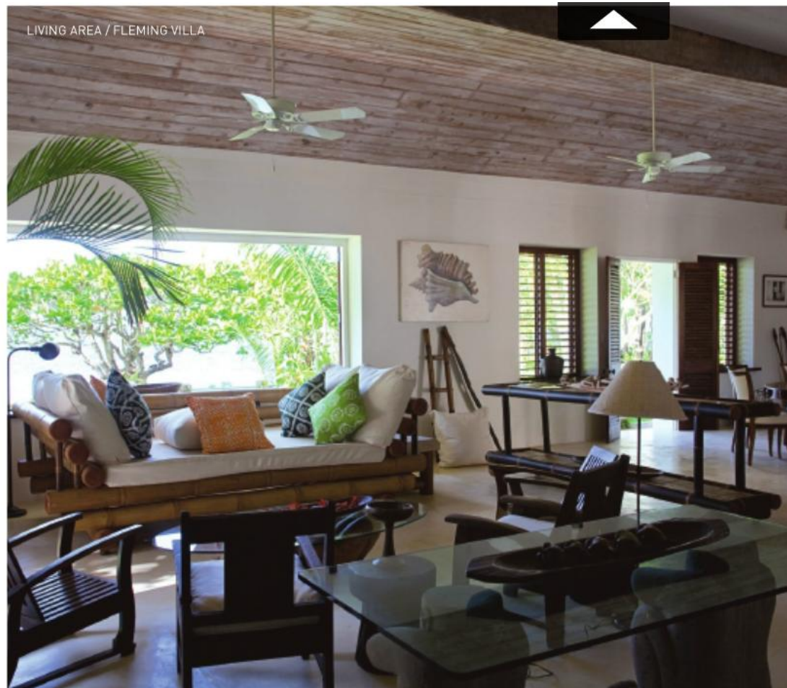
LIVING AREA / FLEMING VILLA

Key selling points | James Bond fans will enjoy this extensive complex, the original home of author Ian Fleming and where he wrote all 14 James Bond novels. A recent renovation of the villa added two new cottages to the main house, and guests who book the space have sole access to the secluded Ian Fleming Beach, a private pool and an ocean-view sunken garden.