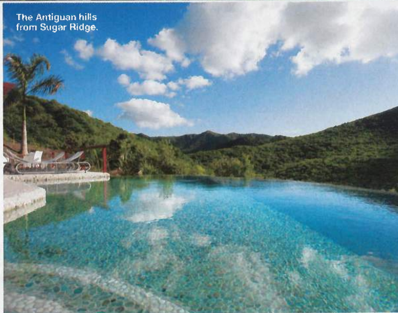
The Antiguan hills from Sugar Ridge.

St. Kitts and its twin island Nevis are beautifully picturesque Leeward Islands just three hours from Miami. With the Caribbean to the west and the Atlantic Ocean to the east, not only do you get cooling trade winds, but sandy beaches of grey and black, plus pristine coral reefs and untouched diving sites. The island also carefully protects its tropical mountain =>