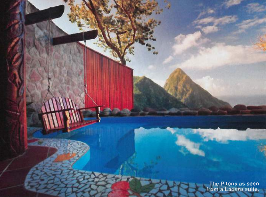
The Pitons as seen from a Ladera suite.

find nirvana. Active travelers can go mountain biking, ziplining and hiking in the jungle, and the hot springs and volcanic mud at the crater at Sulfur Springs Park are considered naturally healing, plus a super fun adventure.