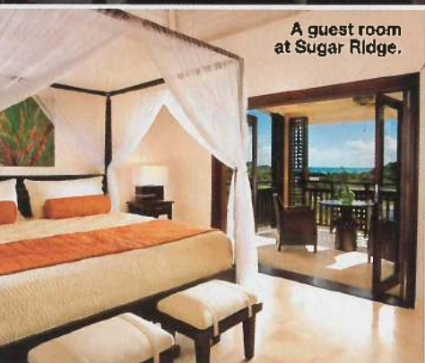
A guest room at Sugar Ridge.

landscape, with over a quarter of the land set aside as a national park. In fact, the Brimstone Hill Fortress National Park is a designated UNESCO World Heritage Site. Climb to Sofa Rock, the top of a dormant volcano, and you'll be able to see clear across to St. Barths, St. Martin, St. Eustatius and Saba.