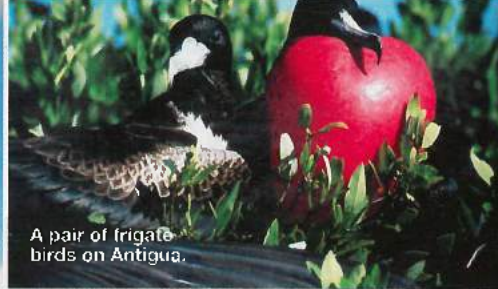
A pair of frigate birds on Antigua.