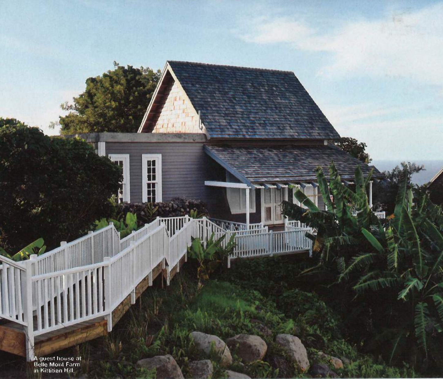
A guest house at Belle Moul Farm in Kittitian Hill.

Sometimes the best way to appreciate the glory of the Caribbean islands and their spectacular tropical beauty is from up on high. Staying at a mountaintop resort can be an intimate experience like no other, and oh, those views! We're not saying you should give up the beach or the warm Caribbean surf entirely, but here are four fantasy islands where you can find the ultimate escape at a higher elevation.