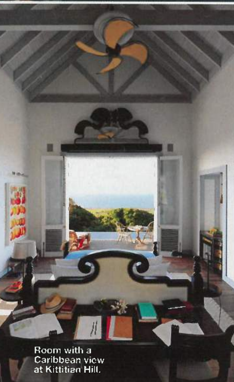
Room with a Caribbean view at Kittitian Hill.