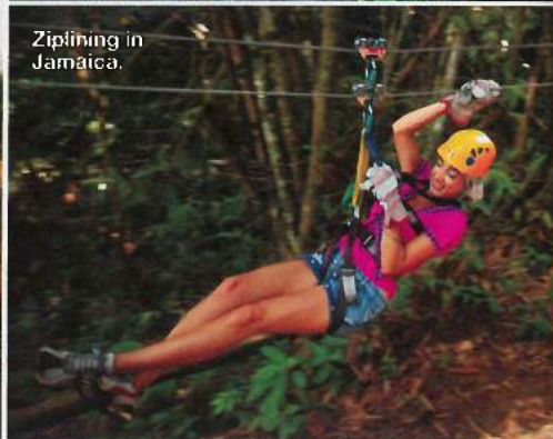
Ziplining in Jamaica.