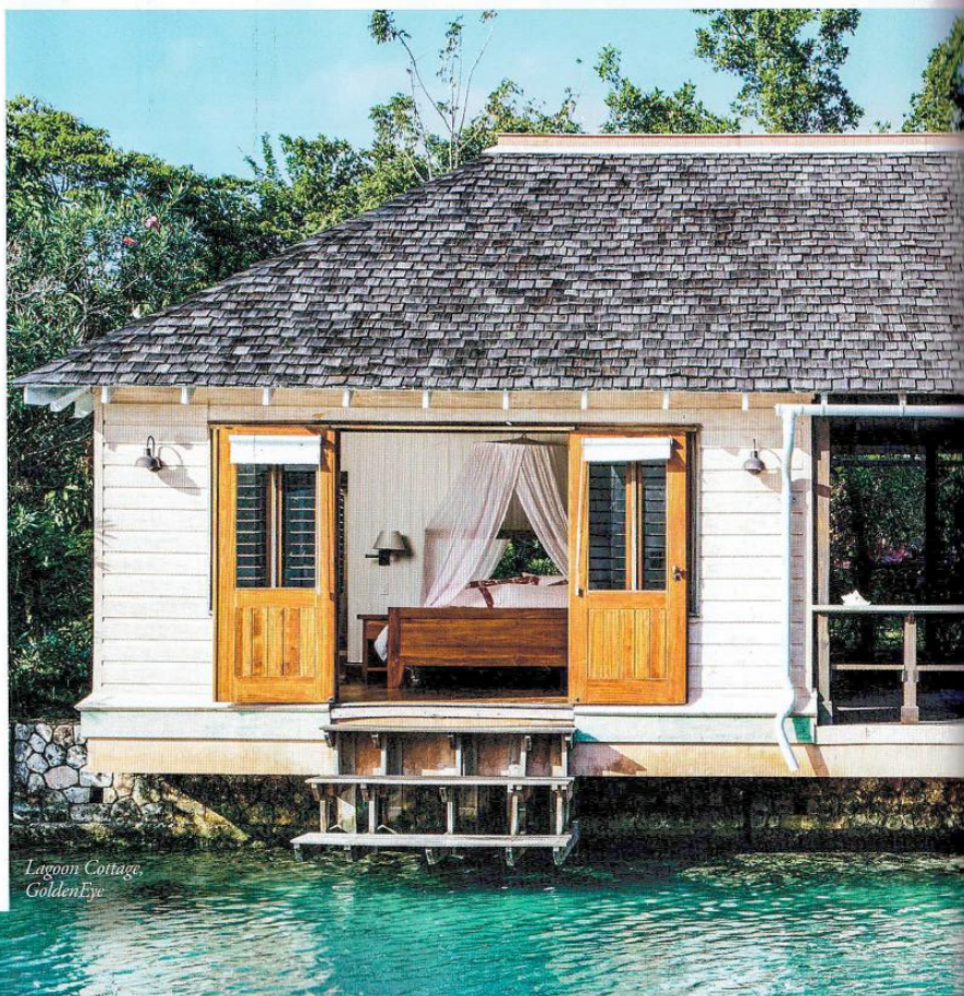
Lagoon Cottage, GoldenEye

Home to the most idyllic luxury escape for the world-weary traveller, GoldenEye is an irresistible pool of hedonism that beckons the likes of Kate Moss, Naomi Campbell and Sofia Richie, who love frolicking on the sands and diving for conches like modern-day Honey Ryders. This is, after all, where Ian Fleming dreamed up Dr No and Ursula Andress emerged from the sea in that bikini. Days drift by in a sun-drugged haze: you can snorkel in the coral gardens with the Oracabessa Foundation and local fishermen checking out GoldenEye's incredible marine conservation work. Button Beach is a dreamy waterfront hangout for barbecue lunches of grilled snapper and jerk; ditto, the Bamboo Bar for piña coladas and Red Stripes. Book ahead for owner Chris Blackwell's New Year's party, a legendary affair fuelled by rum punch and hibiscus bellinis, where you can dance to reggae and dancehall classics until the early hours, or do the splits on the Bizot Bar table like Grace Jones, before crashing out in one of the chic new beach huts or the dreamy lagoon villas. To act out your James Bond fantasy, rent the glorious Fleming Villa that sleeps up to 10 guests and comes with its own butler and staff. Inspiring Travel Company (inspiringtravelcompany.co.uk) offers seven nights from £2,235, including flights and transfers.